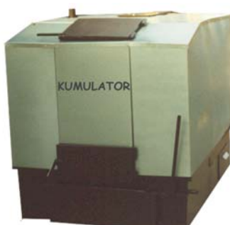
KOCIOŁ STALOWY KUMULATOR 150 kW

Our product is manufactured conforming the ISO Norm 9000:2001 TÜV CERT GERMANY, and fulfill hardest emission norms in Europe.